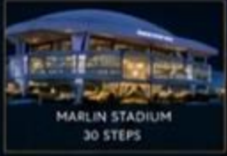
MARLIN STADIUM 30 STEPS