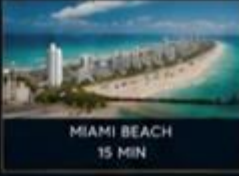
MIAMI BEACH 15 MIN