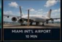
MIAMI INT'L AIRPORT 10 MIN