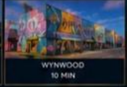
WYNWOOD 10 MIN