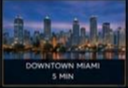
DOWNTOWN MIAMI 5 MIN