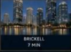
BRICKELL 7 MIN